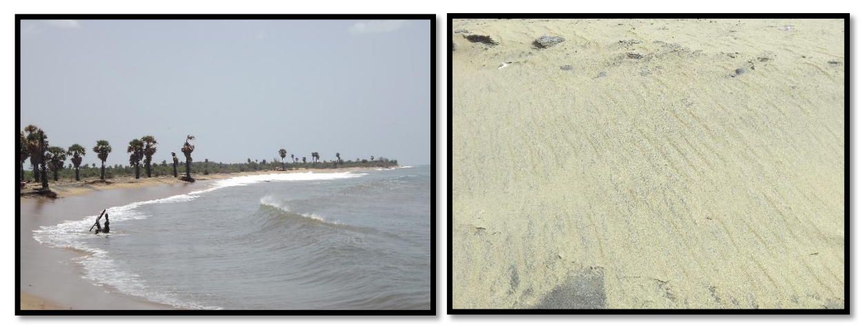
Figure 5:-Sandy Beach. Figure 6:-Sand Ripple.