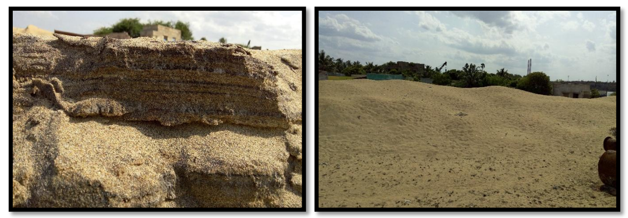
Figure 3:-Sand Dune.