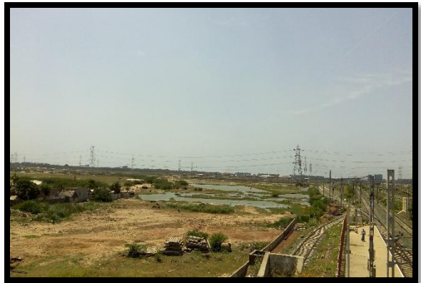
Figure 8:-Coastal Plain Area.