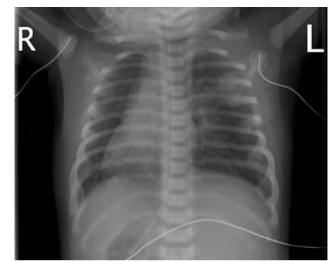
Fig 4:- Xray chest of newborn with dextrocardia, situs inversus