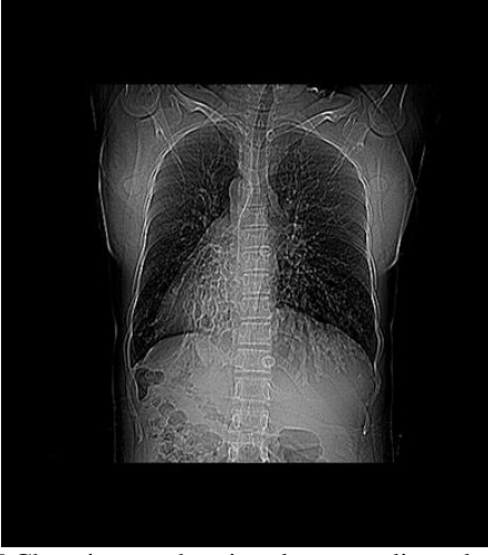
Fig 1:- CT Chest image showing dextrocardia and situs inversus