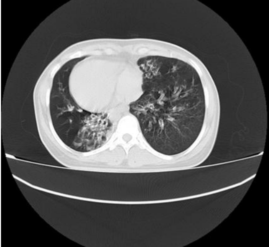
Fig 2, 3:- axial CT image showing wih e/o ectatic changes with air fluid level in suprabasal, medial, posterior segment of left lower lobe,lingular lobe.