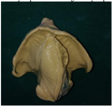
Figure 7:- Master Cast