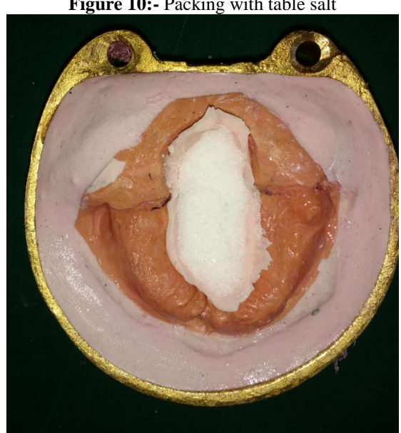
Figure 10:- Packing with table salt