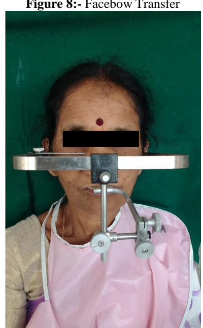
Figure 8:- Facebow Transfer