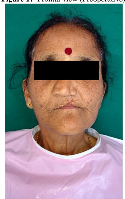
Figure 1:- Frontal view (Preoperative)

The prosthesis was then inserted in the patients' mouth and the extensions, speech, occlusion and esthetics were evaluated. Necessary adjustments were done. Speech showed a definite improvement and patient was happy as there was a considerable improvement in esthetics. Patient was very cooperative during the whole procedure. Patient was followed up after 1 day, 1 week, 1 month. Necessary denture corrections were done in the follow up visits.