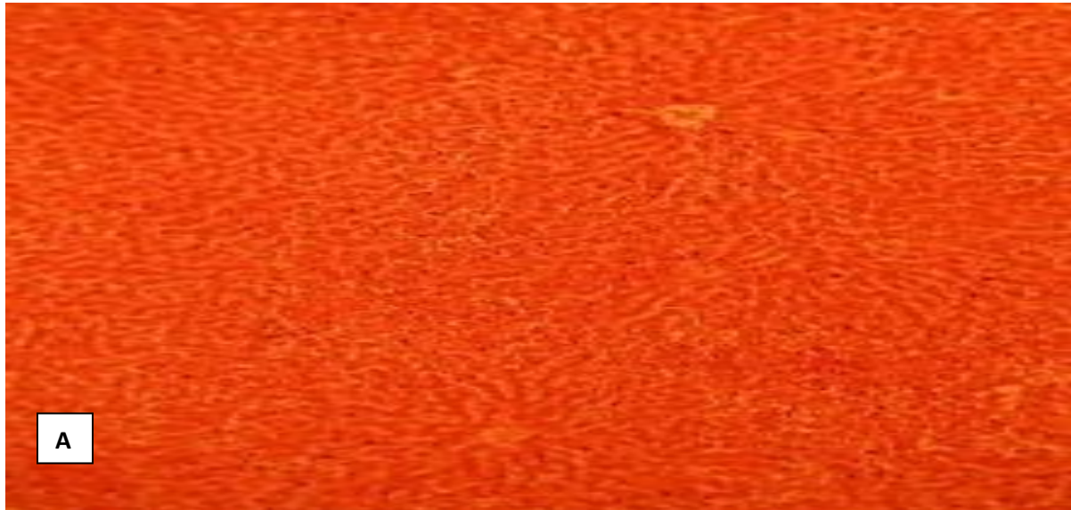
Plate A: - Transverse section of liver control (Eosin and haematoxylin × 1000).